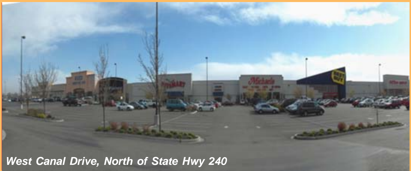
West Canal Drive, North of State Hwy 240

COLONNADE SHOPPING CENTER KENNEWICK, WA (TRI-CITIES)