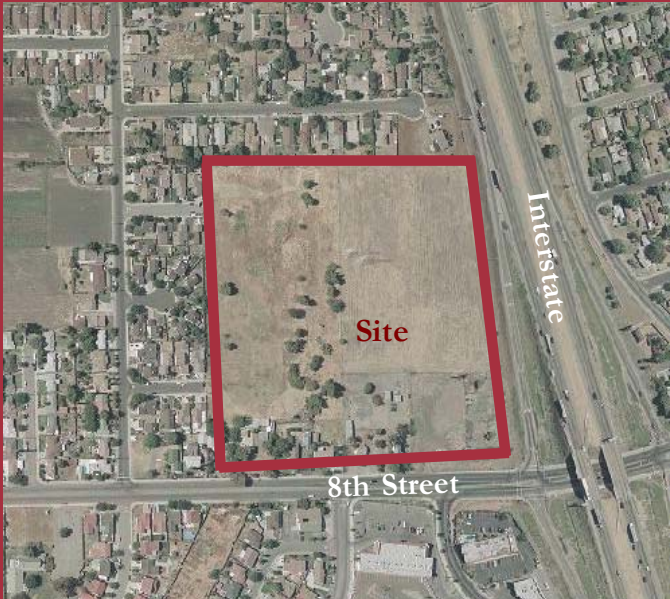
I-5 & 8th Street